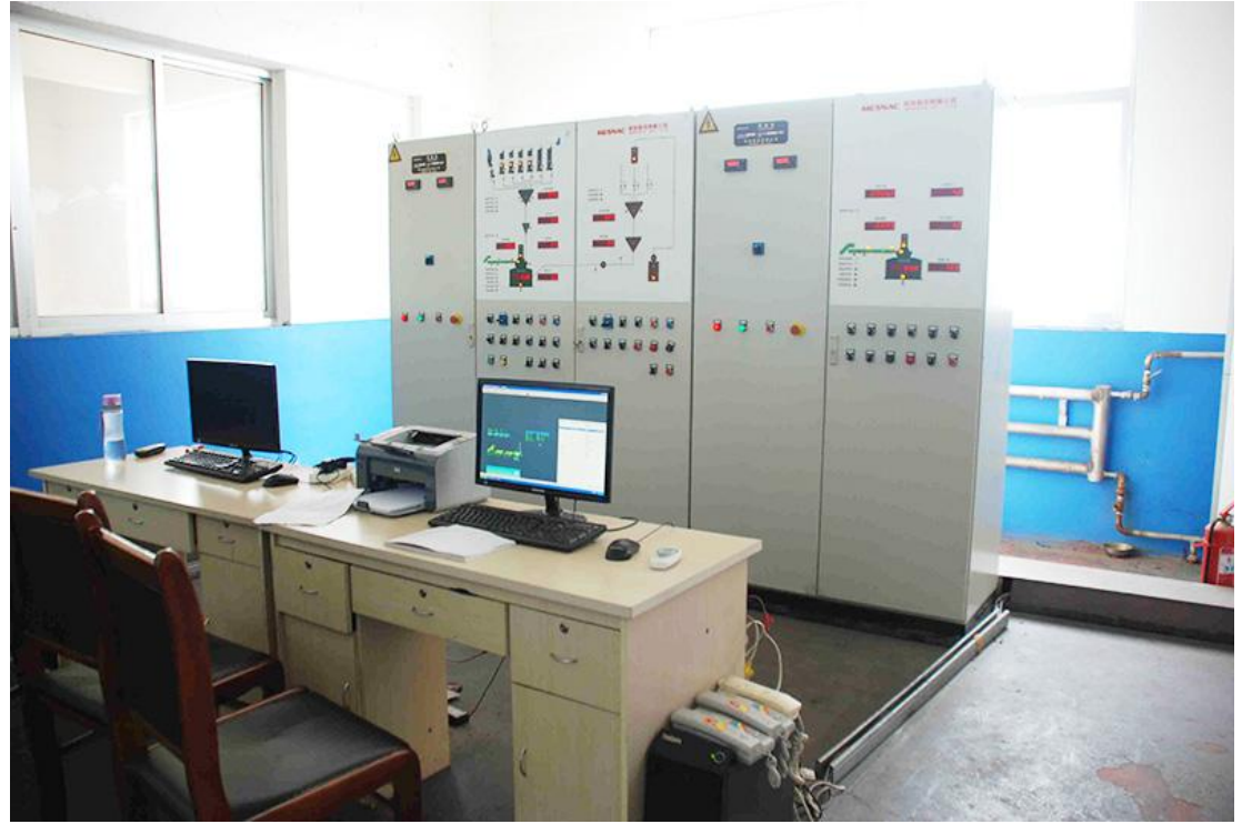
Deliver, Shipping And Serving