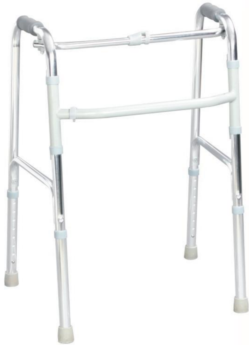
PM050020001 MAIN PARAMETERS (cm)