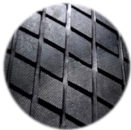
diamond type:78x45 mm