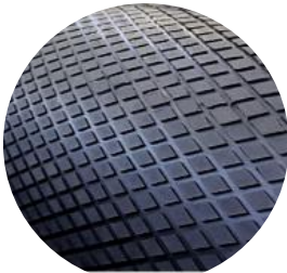
diamond type:35x18 mm