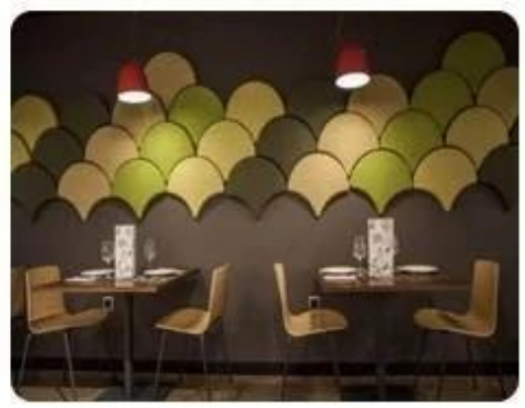
Restaurant & Hotel