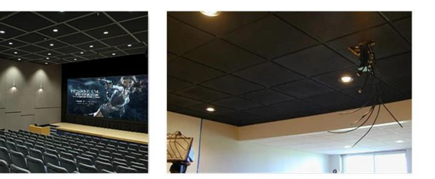
---- Home Theatre ----