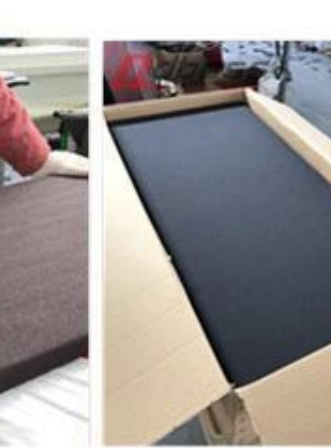
7 QC & Packing

5 Apply the eco-friendly 6 Wrap the fabric glue on the fiberglass panel