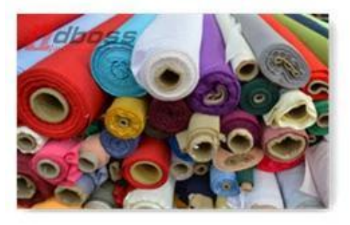
A1 Original Fabric