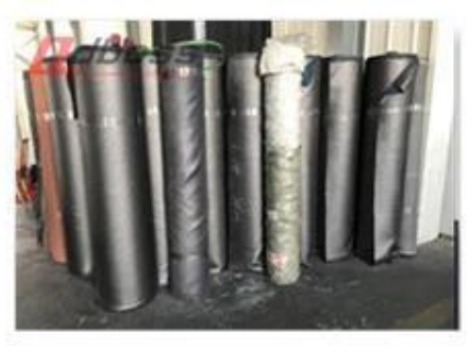
A3 Flame-retardant Fabric