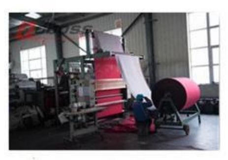
A2 Flame-retardant treatment