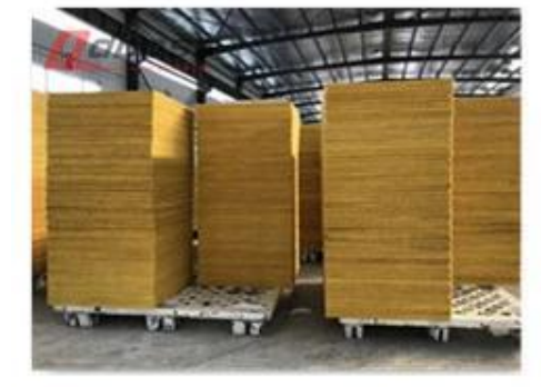
B1 Original fiberglass panel