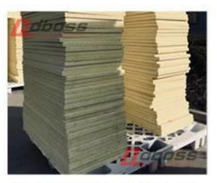
B2 Cutting different sizes/shapes B3 Resin curing & Air drying