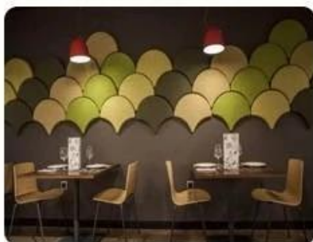
Restaurant & Hotel