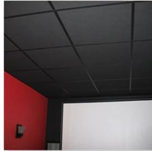
---- Studio Room ----