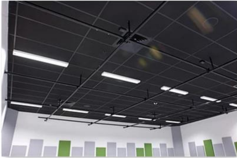
---- Office ----

QDBOSS Fiberglass ceiling tiles can be used in many public places where has strict request for acoustics, like Cinemas, Churches, Offices, Music Rooms, Auditoriums, Schools, Multi-purpose Rooms, and Theaters. We supplied large quantity of these false ceilings to many domestic and overseas projects and even built distributor relationships with some customers overseas. The fiberglass acoustic ceiling is made by fiberglass board and fiberglass felt. It is incombustible and eco-friendly, as a best solution for many public places. Customers also can ask different colors for the fiberglass felt on surface as their own requirements.