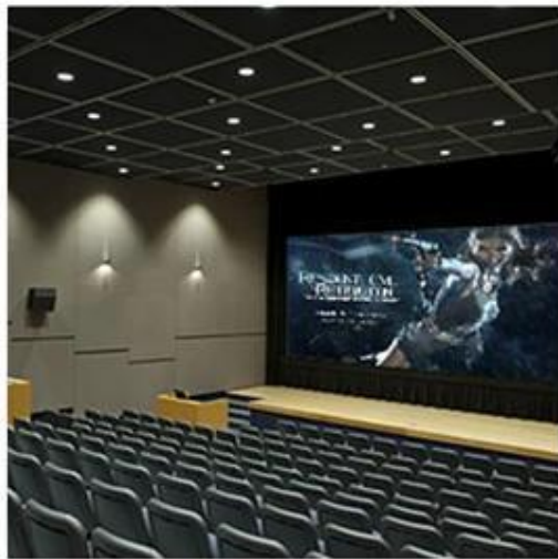
---- Cinema ----