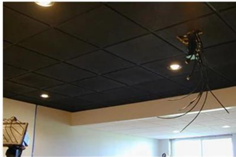
---- Home Theatre ----