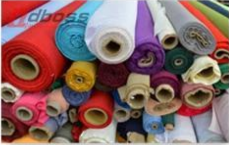
A1 Original Fabric

strict quality control system. Our company has won a great reputation in the global market with the best products and an excellent service. QDBOSS ACOUSTIC SOLUTION looks forward to cooperating with you in near future.