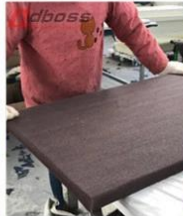
6 Wrap the fabric