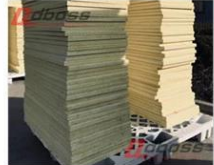
B3 Resin curing & Air drying