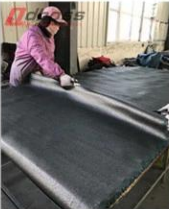
4 Fabric cutting