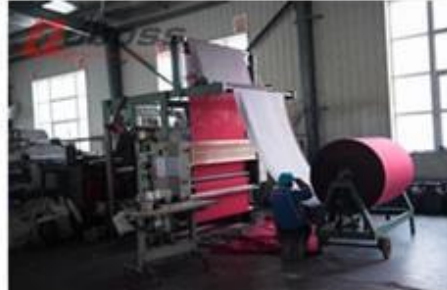
A2 Flame-retardant treatment