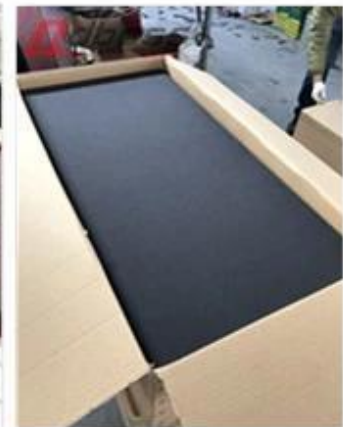
7 QC & Packing

For 24 hours contact Qdboss acoustic solutions details as below: