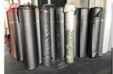
A3 Flame-retardant Fabric