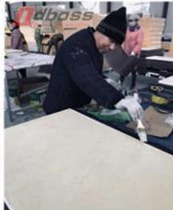
5 Apply the eco-friendly glue on the fiberglass panel