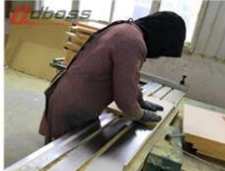
B2 Cutting different sizes/shapes