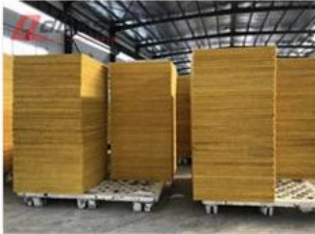
B1 Original fiberglass panel