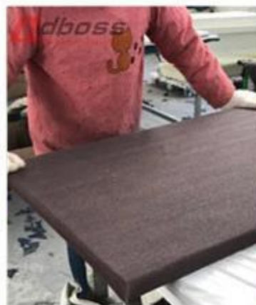
6 Wrap the fabric