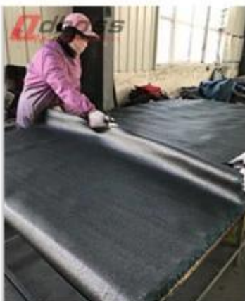
4 Fabric cutting