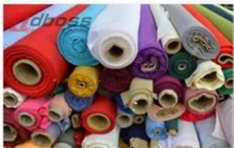
A1 Original Fabric