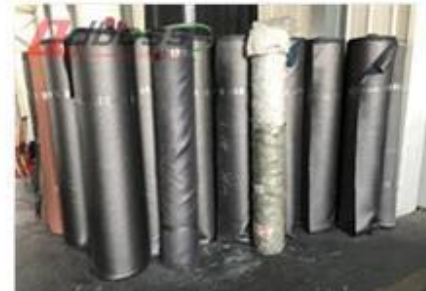
A3 Flame-retardant Fabric