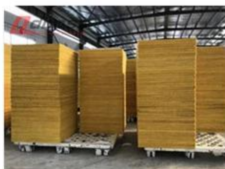
B1 Original fiberglass panel