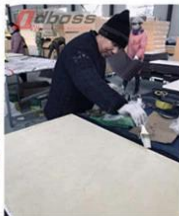
5 Apply the eco-friendly glue on the fiberglass panel