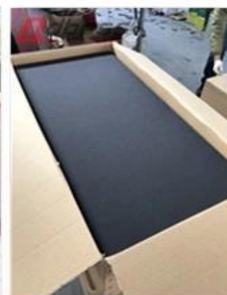
7 QC & Packing

For 24 hours contact Qdboss acoustic solutions details as below: