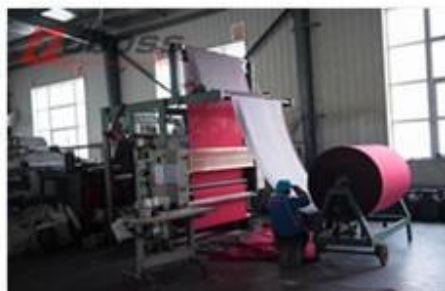
A2 Flame-retardant treatment