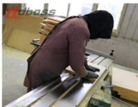
B2 Cutting different sizes/shapes