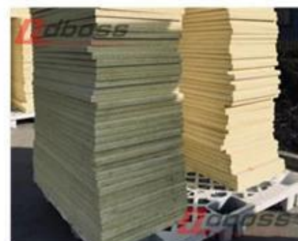
B3 Resin curing & Air drying