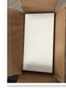
Step4: Put a piece polyfoam cover top