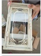
Step1: Put polyfoam in the lantern

We are committed to putting our customers as the first priority, by providing high quality products, integrity, honesty and accountability in our worldwide business