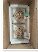
Step3: Put the lantern in carton with polyfoam in it