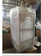
Step2: Use bubble-paper to wrap the lantern