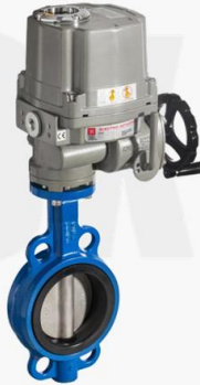
Electric soft seal butterfly valve