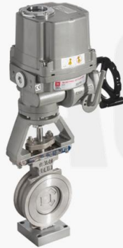
Electric hard seal butterfly valve