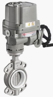
Electric teflon butterfly valve