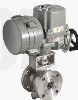
Electric V-ball valves