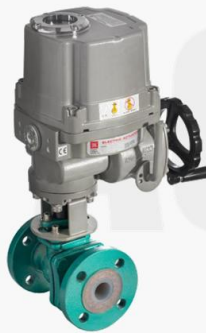
Electric fluorine lined ball valves