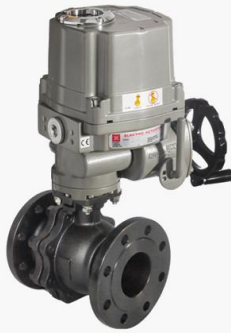
Electric ball valves