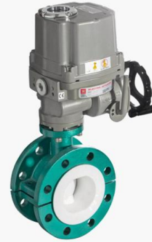
Electric fluorine lined butterfly valve