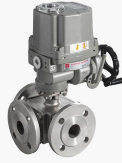
Electric three-way ball valve