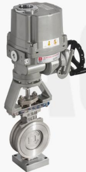
Electric hard seal butterfly valve