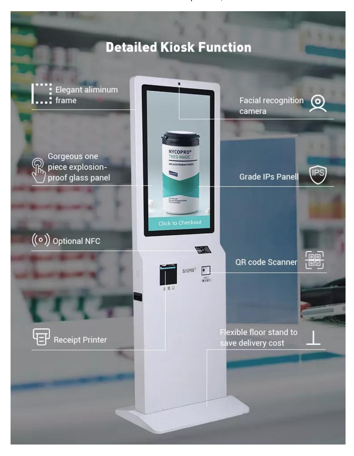
Product Feature and Application