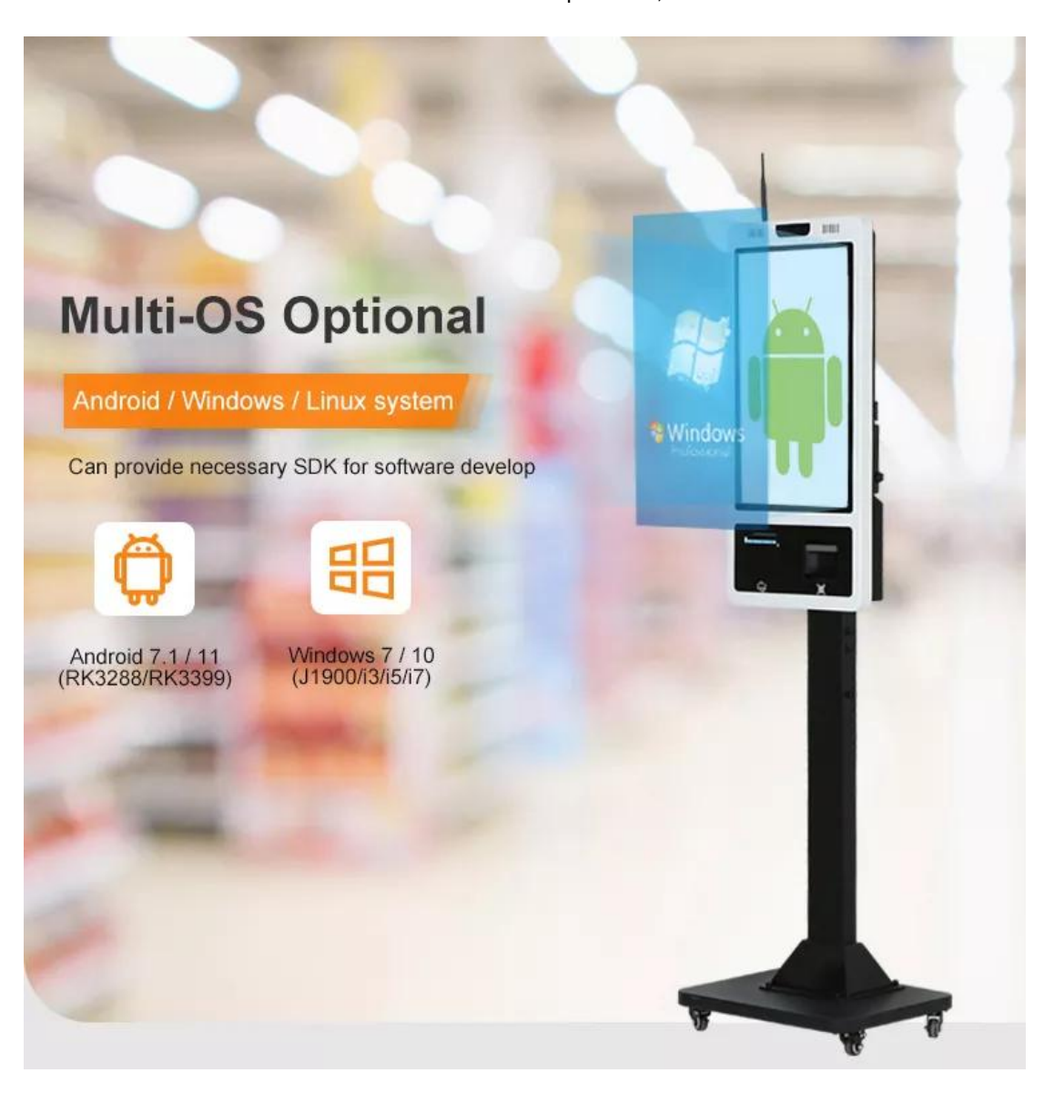
Product Feature and Application