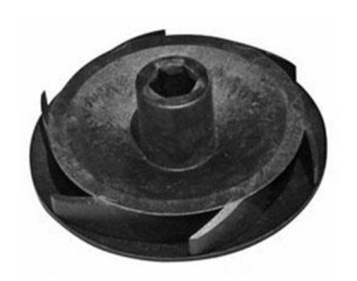
ERBIWA MOULD INDUSTRIAL CO., LTD http://www.erbiwa-mould.com