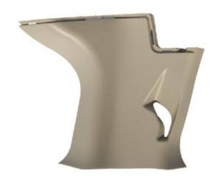
ERBIWA MOULD INDUSTRIAL CO., LTD http://www.erbiwa-mould.com