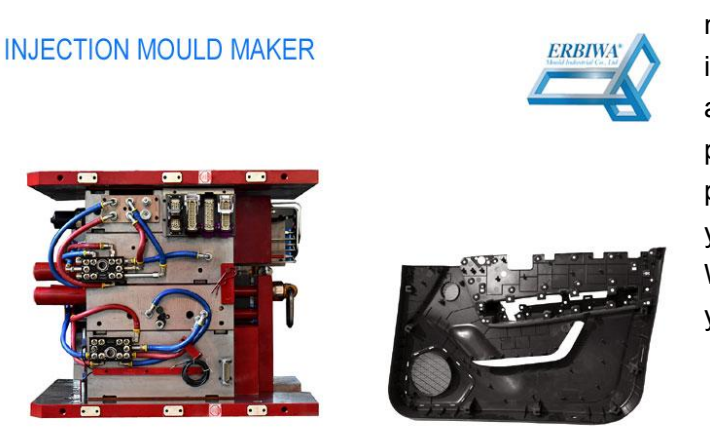
ERBIWA MOULD INDUSTRIAL CO., LTD http://www.erbiwa-mould.com

We have rich experience in manufacturing Auto panel injection parts in good quality, and we has specialized in precision plastic mould and plastic part manufacture for years, serving global customers. We are expecting to become your long term partner in China.