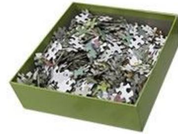
Custom frameless puzzle