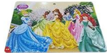
Custom frame puzzle