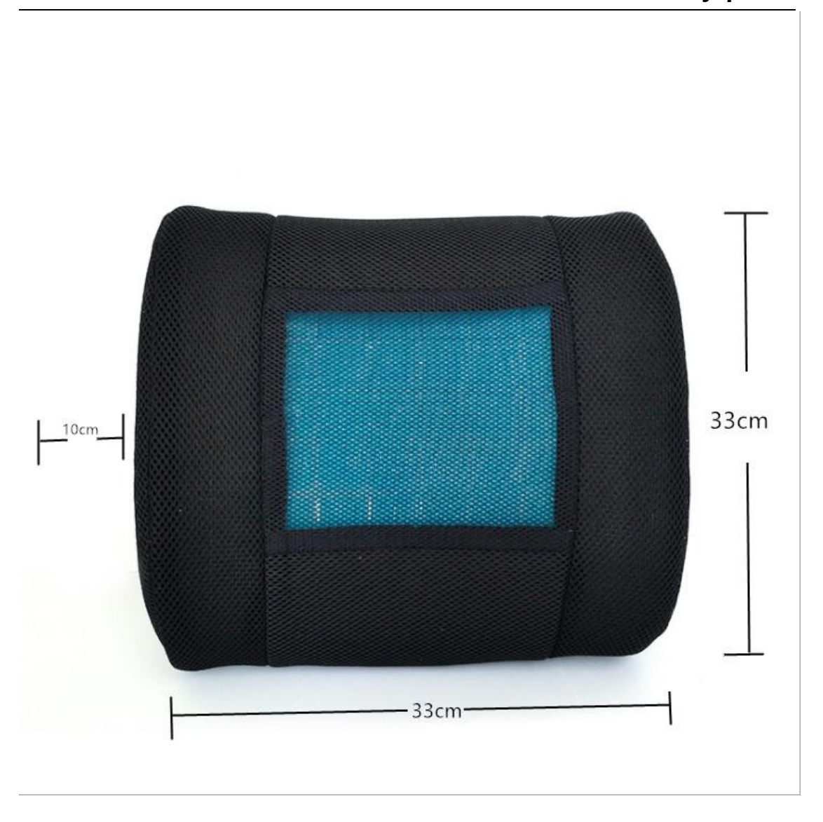
Product Qualification of Memory Foam Lumbar Support Back Cushion