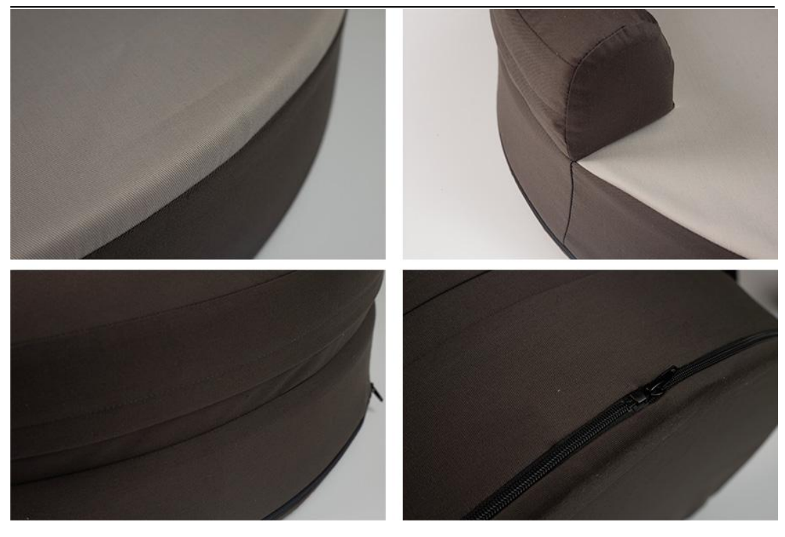
Product Qualification of Circular ergonomic design memory foam pet bed