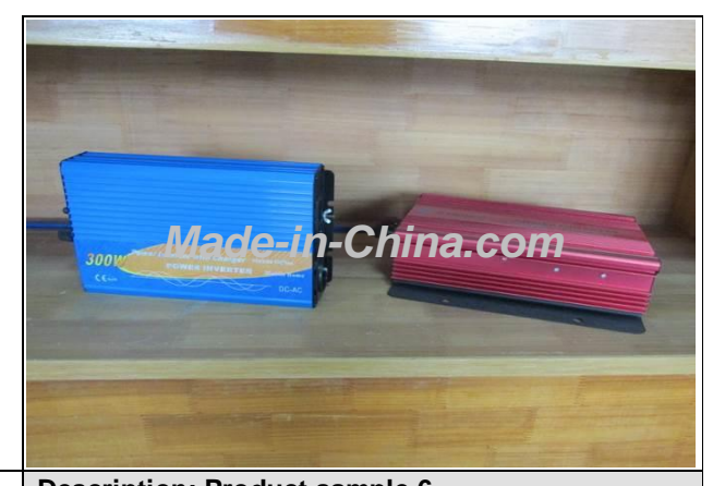
Description: Product sample 5