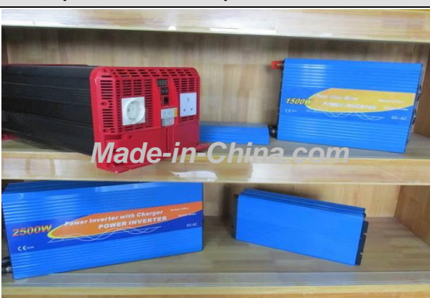
Description: Product sample 4