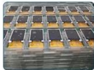
VACANCY TRAY ADHESIVE TAPE