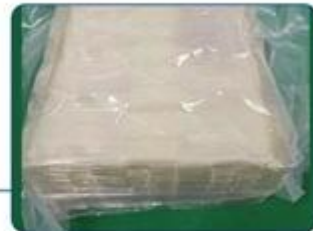
SHOCKPROOF & WATERPROOF