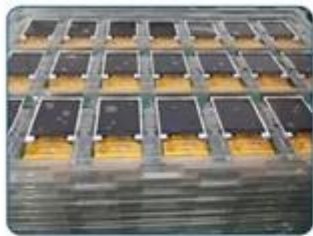
VACANCY TRAY ADHESIVE TAPE