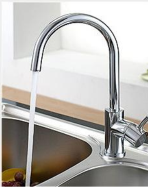
1. Open the tap