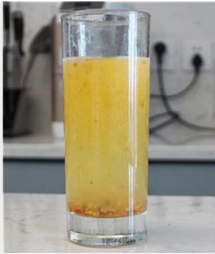
The kitchen is ground to foam Refuse clogging of sewer