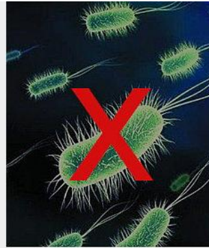
Prevent bacterial growth Family health and worry