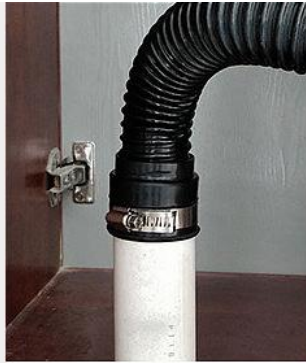
Locking hose Waterproof bed bug