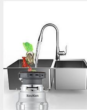
3. Pour food waste