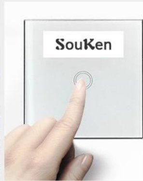
2. Start smart switch