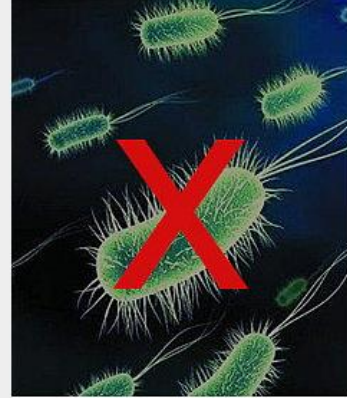
Prevent bacterial growth Family health and worry