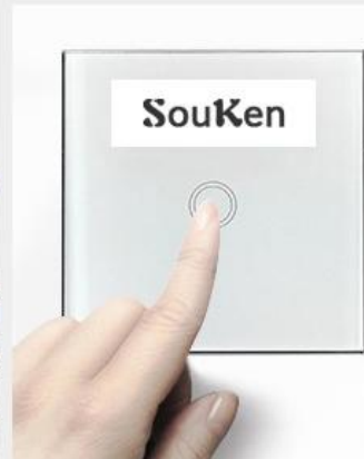
2. Start smart switch