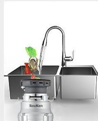
3. Pour food waste