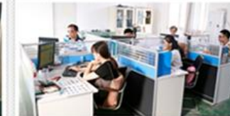
Reliable manufacturing ability to meet your design requirements