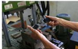
Reliable supply ability