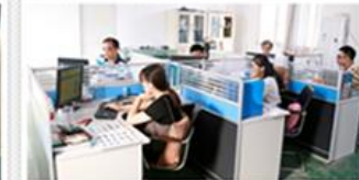
Reliable manufacturing ability to meet your design requirements