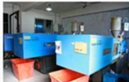
Precise Mould Development