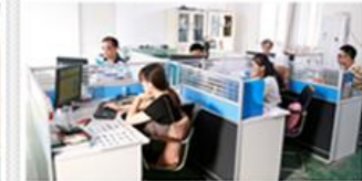
Reliable manufacturing ability to meet your design requirements