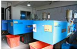
Precise Mould Development