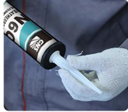
3.Install the Nozzle Into the Bottle Top