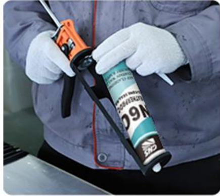
1.Loading the Glue Gun