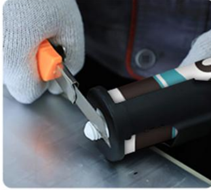
2.Cut the Bottle Top