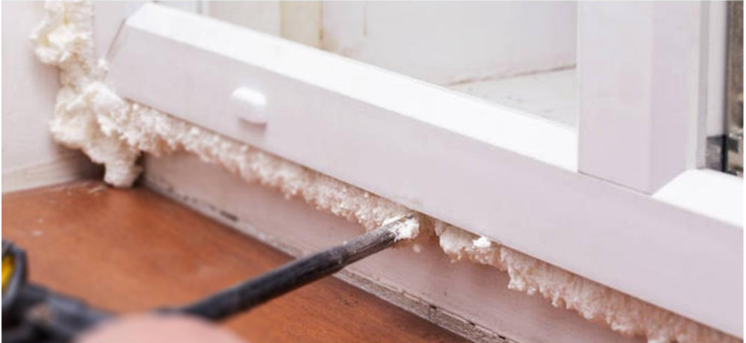
Installation of door and window frames