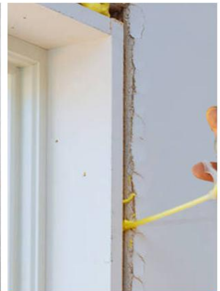
Door and window fixing