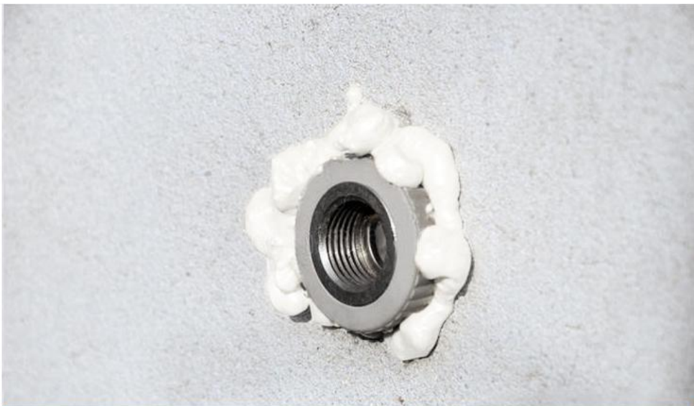
Fill the gap