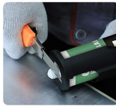
2.Cut the Bottle Top