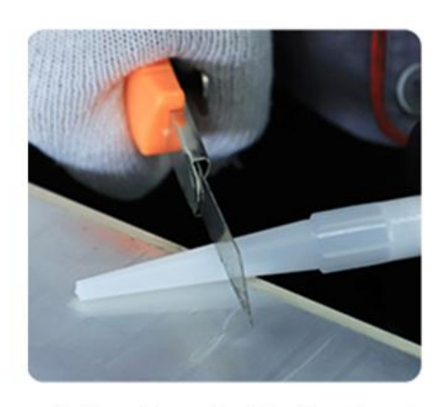
4.Cut Nozzle To Desired Based Size