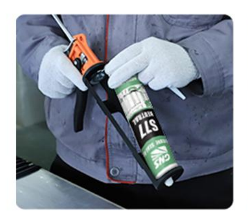
1.Loading the Glue Gun