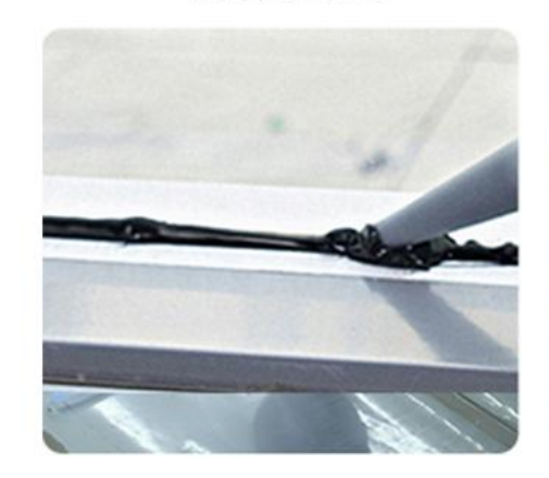
7. Evenly Gluing