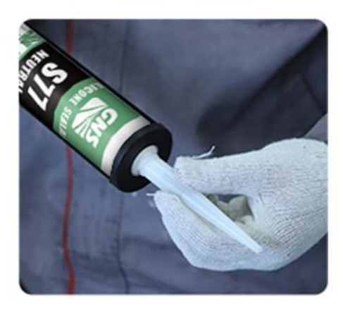
3.Install the Nozzle Into the Bottle Top