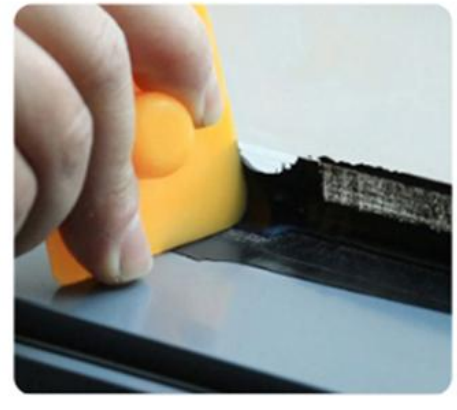
8. Scrape off Any Excess Glue 9. Remove Masking Tape