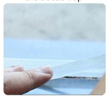
6. Mask Both Sides of Joint With Masking Tape