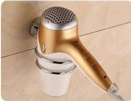
Hair Dryer Shelf