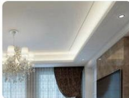
Gypsum Board Decoration