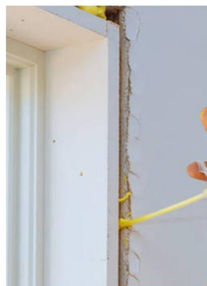
Door and window fixing