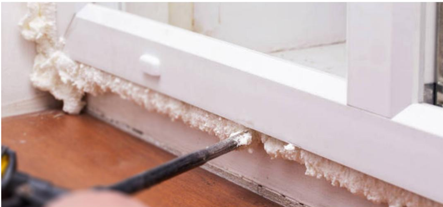
Installation of door and window frames