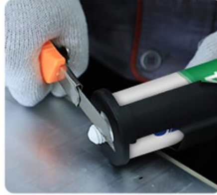
2.Cut the Bottle Top