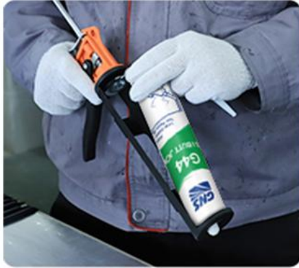
1.Loading the Glue Gun