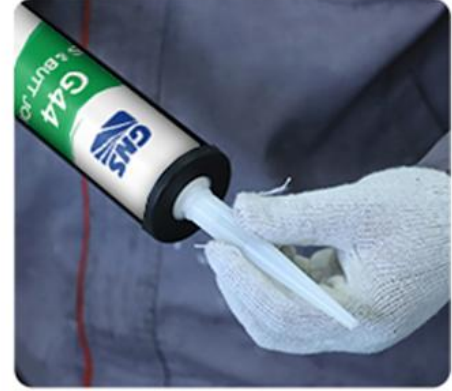
3.Install the Nozzle Into the Bottle Top