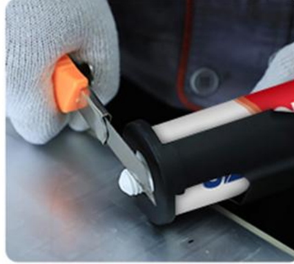
2.Cut the Bottle Top