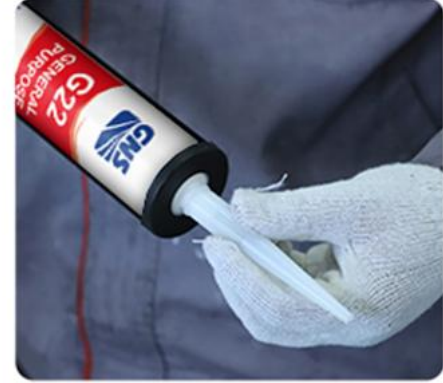
3.Install the Nozzle Into the Bottle Top