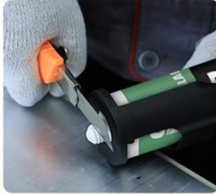
2.Cut the Bottle Top