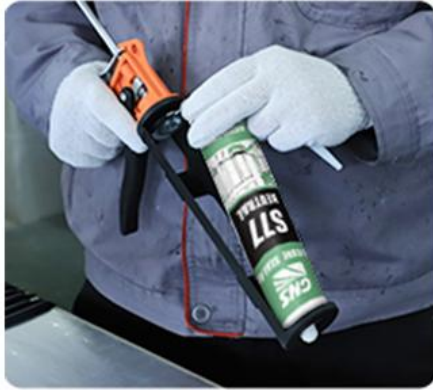
1.Loading the Glue Gun