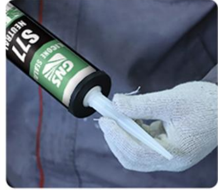
3.Install the Nozzle Into the Bottle Top