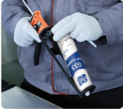
1.Loading the Glue Gun