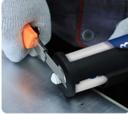
2.Cut the Bottle Top