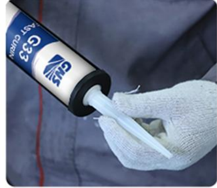
3.Install the Nozzle Into the Bottle Top