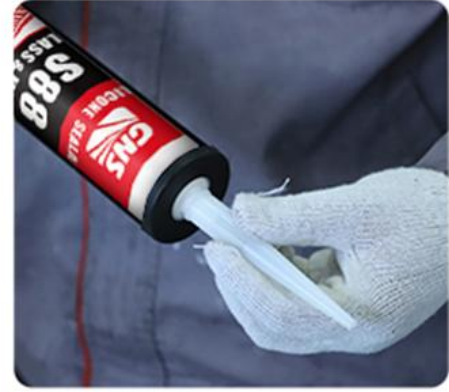
3.Install the Nozzle Into the Bottle Top