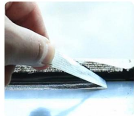
9.Remove Masking Tape Immediately