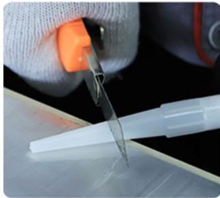
4.Cut Nozzle To Desired Based Size