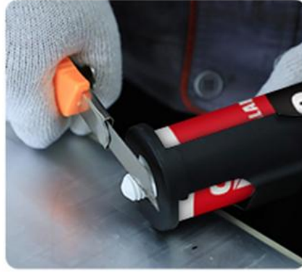
2.Cut the Bottle Top