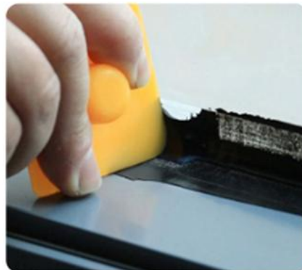
8.Scrape off Any Excess Glue