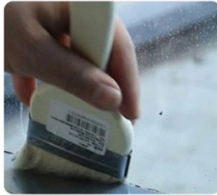
5.Remove Dirt, Grease, Moisture and Old Caulk