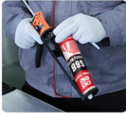
1.Loading the Glue Gun