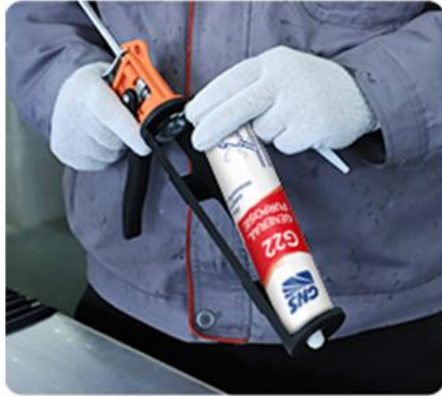
1.Loading the Glue Gun