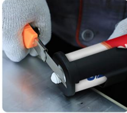
2.Cut the Bottle Top