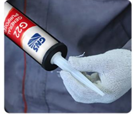
3.Install the Nozzle Into the Bottle Top