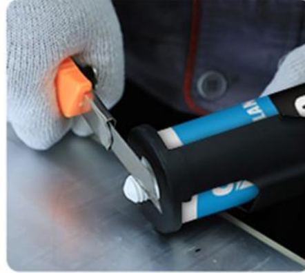
2.Cut the Bottle Top