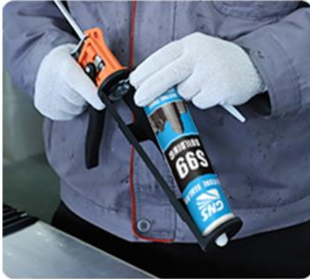
1.Loading the Glue Gun