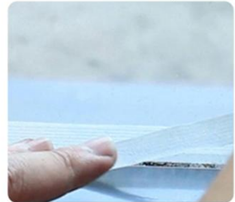
6.Mask Both Sides of Joint With Masking Tape