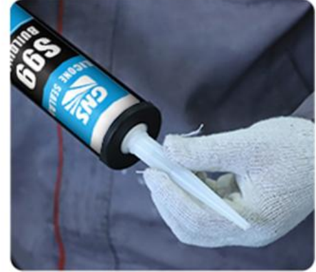
3.Install the Nozzle Into the Bottle Top