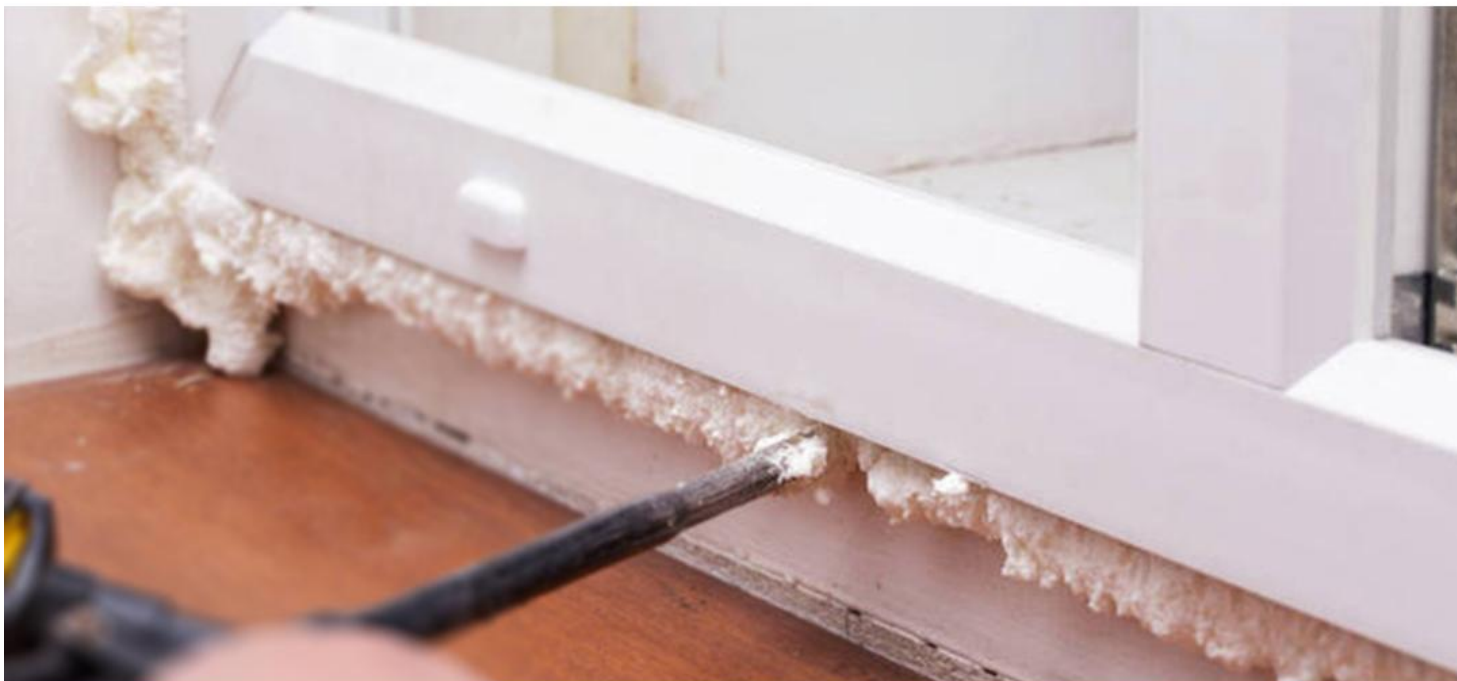
Installation of door and window frames